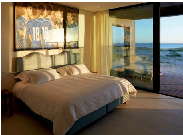
Facing page and this page: Interior and exterior views of the hotel boasting vibrant art

Celebrating the ambiance of its chic setting, Bahia Vik consists of eleven uniquely designed bungalows tucked into the sandy beach dunes, with one central building around which retreat living revolves. This main building, built of a stunning Uruguayan grey slate, is defined by open architecture and flowing spaces, encouraging conviviality among guests of the property. Upon entering the retreat's main building through garden walls, guests enjoy views of the Southern Atlantic Ocean through the spacious reception area, and the verdant open-air courtyard around which the structure centers. To either side of the entrance, guests can find a large library, game room and a small boutique offering a curated selection of Uruguayan art and local crafts. Just down the walkway visitors can also discover a fully equipped gym and luxurious spa, while across the sun-filled courtyard, an expansive double living room and dining room look out onto four stunning dark stone beachside reflecting pools set in the dunes and surrounded by al fresco lounging and dining areas. The main building boasts ten unique suites, all with large private terraces. With two levels of guestrooms in the main building, upper level master suites have the added advantage of either broad sweeping views of the Uruguayan landscape or sparkling ocean.