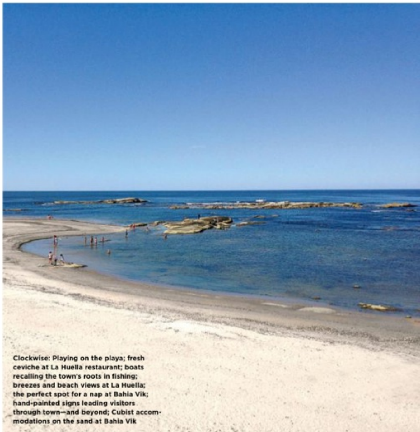
Clockwise: Playing on the playa; fresh ceviche at La Huella restaurant; boats recalling the town’s roots in fishing; breezes and beach views at La Huella; the perfect spot for a nap at Bahía Vik; hand-painted signs leading visitors through town—and beyond; Cubist accommodations on the sand at Bahía Vik

And lost we get. A stroll to the town’s iconic lighthouse segues into a long seafood lunch, sweetened by rosé and dulce de leche cake, on the cozy porch of