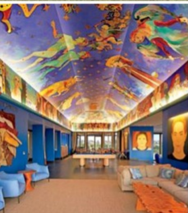
Clockwise from above: A hungry resident grazing at Estancia Vik; José Ignacio Lighthouse; ceiling murals adorning Bahía Vik's lobby